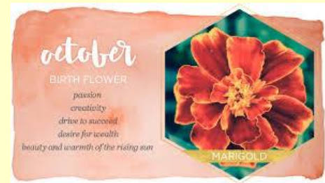
October Flower Marigold