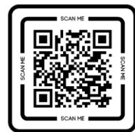
QR Code for Pecans

You can share the QR code or the website with friends and family and they can order direct from Terri Lynn. Free shipping with minimum purchase!!